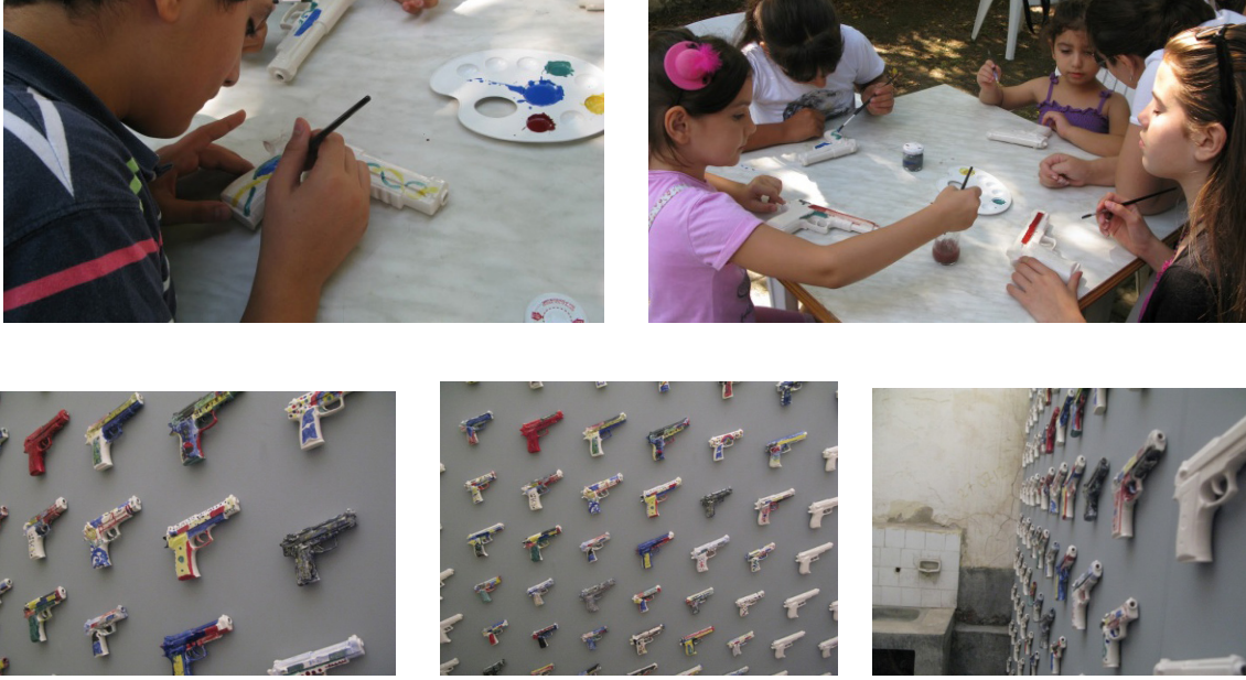
Image 10, 11, 12, 13, 14. İnsel İnal, "Installation, 300 + guns", (50 of which are painted by children who attended a workshop in Sinop", 2012.

When we look at Inal's works, it is apparent that he is responding to contemporary topics using political expressions. Therefore, some statements in his works are deliberate. He has transformed objects of daily use into a tool in art and has used a critical means of expression.