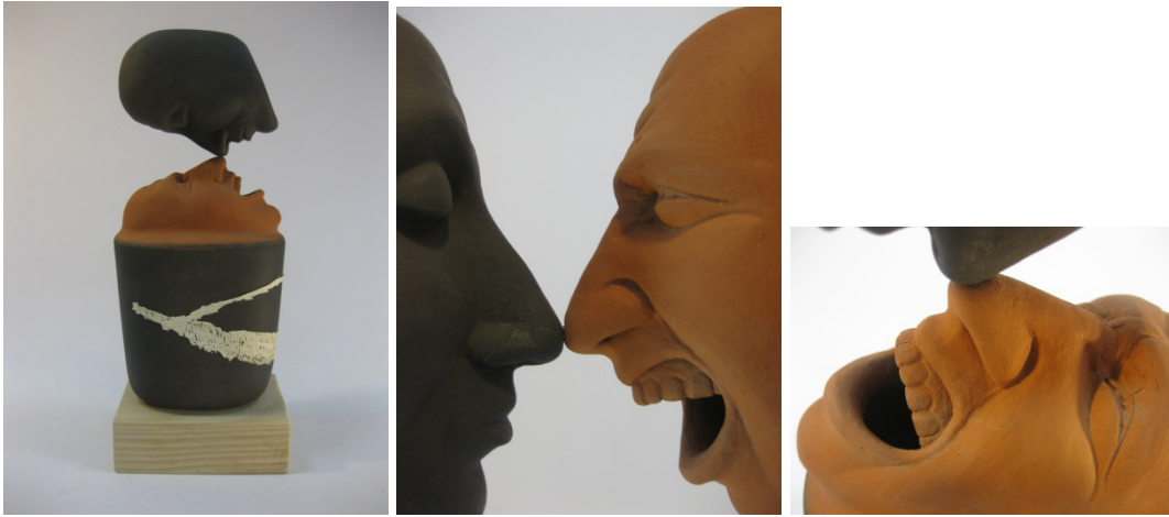
Image 17, 18, 19. Bahar Ari Dellenbach, “ Reflection”, 15x35x10 cm., 1200 C, 2015

The artist constantly tries to expand the boundaries of the material. Aside from this he is also known for his constructive criticism in ceramic and art education, and his conscientious approach to societal occurrences.