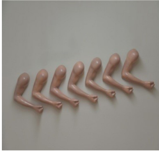
Image 15. Candeğer Furtun, "Untitled", 1994, Ceramic (High Temperature), 48x25x13 cm.

Candeğer Furtun displays an inquisitive approach to the state and position of ceramic sculpture with her installations. With great dexterity she transforms characteristics such as the form, colour and fabric of the parts of the body into ceramic sculptures. The space where the sculptures that are designed in modular form are exhibited is the artist's place of action; her sculptures serving her expression. The works are realistic representations of the human figure. It creates a breaking point in the viewer's perception of the absolute. When the viewers arrive at the exhibition area, they come face to face with life-size dimensions of the human body. Thus, they communicate and confront their own body and other ceramic bodies. Furtun's work (Image 15) has been exhibited at the "Bozlu Art Project, Respect/Saygi II" exhibition in 2016, among the works of nine of Turkey's most important sculpture artists. The exhibition "by approaching important figures in Turkey's modern and contemporary journey in sculpture, reminds us of our struggle with sculpture in the public arena and inspires new conceptions with an approach that incorporates sole statements independent from the market conditions of the work of art, that changes, transforms and creates new awareness in the viewer, constructing "Respect" for its multifaceted structure." 7