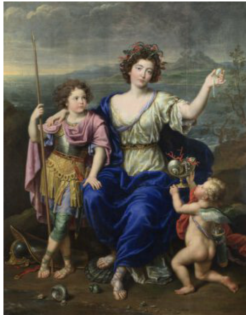
Figure 7. Pierre Mignard, The Marquise de Seignelay and Two of Her Sons , 1691, oil on canvas, 154 x 194 cm, The National Gallery, London.

French Baroque painter Pierre Mignard (1612-1695) depicted the recently widowed Catherine-Thérèse, Marquise de Seignelay (1662–1699) and two of her five sons as characters from Greek and Roman mythology (Figure 7). The Marquise is probably meant to represent the sea goddess Thetis, but could also be interpreted as Venus, the goddess of love, with her attributes: a scallop shell and strings of pearls. Her sons are painted as Cupid, god of love, and Achilles, a Greek hero of the Trojan war. The children gaze towards a small portrait cameo, which could be of their father, alluding to his death. The figures are surrounded by sea and different kinds of shells, references to her husband's profession in the French royal navy ( www.nationalgallery.org.uk ).