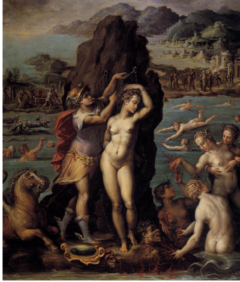
Figure 12. Giorgio Vasari, Perseus and Andromeda , 1570-72, oil on slate, 100 x 117 cm, Palazzo Vecchio, Florence.

The elegant Coral Fishers (Figure 13), also referred to as Allegory of the Discovery of the New World , by the Italian Mannerist painter Jacopo Zucchi (1541-1590) formerly decorated Cardinal Ferdinando's studiolo in the Villa Medici in Rome. Zucchi enriched mythological stories and allegorical pictures with an attention to naturalistic details ( www.wga.hu ).