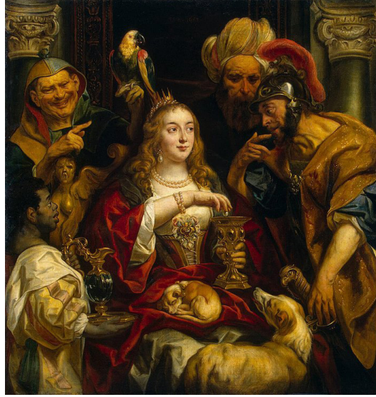
Figure 5. Jacop Jordaens, Cleopatra's Feast , 1653, oil on canvas, 149.3 x 156.4 cm, Hermitage Museum, Leningrad.

The Armada Portrait (c.1588) attributed to George Gower (c.1546-1596) (Figure 6) is an impressive picture of Queen Elizabeth I (1533-1603). It is a statement of power and authority with Queen Elizabeth I as Empress of the world and commander of the seas. It is known as The Armada Portrait because it commemorates the great sea battle of 1588 when the English fleet defeated the invading Spanish Armada sent to overthrow Elizabeth. The view of the battle in the two windows, recalls Elizabeth's victory. Her hand is firmly on the globe and the mermaid hints at her dominance on the seas. Her dress, in her preferred colours of black and white, also proclaims her rank and is covered with precious pearls (www.woburnabbey.co.uk).