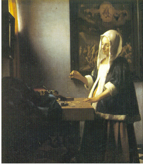
Figure 8. Johannes Vermeer, Woman Weighing Pearls , c. 1662, oil on canvas, 38 x 42,5 cm, National Gallery of Art, Washington.

them. Vermeer is portraying the sin of vanity by emphasizing the sparkle of the pearls taken from the boxes (Schneider, 2004, p. 56-59).