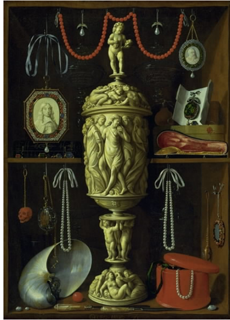
Figure 14. Georg Hainz, Kunstkammer Cabinet with Ivory Goblet , 1665-67, oil on canvas, 61 x 83,5 cm, National Gallery of Denmark, Copenhagen.

German Baroque painter Georg Hainz's (1630-1700) painting offers an open cabinet filled with a valuable collection of coral and pearl jewellery, minaiaturea and an ivory goblet. The wonders of the nature are presented in a kunstkammer (art chamber in German). The term was first used in the mid 16th century to describe princely collections of paintings, precious goblets, games and natural history samples. By the end of the century the concept was widespread throughout the German courts. Its origins can be traced to the study collections of late 14th century French courts and religious institutions. Such all-embracing collections were perceived to encourage wisdom in kings and leaders. In the 15th century outstanding study collections were established in many Italian courts such as those at Urbino and Mantua. Such ordered and classified collections were forerunners of museums (Clarke, 2010, p. 139).