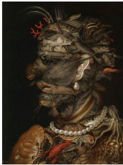
Figure 11. Giuseppe Arcimboldo, The Elements: Water , 1566, oil on wood, 52 x 67 cm, 52 x 67 cm, Kunsthistorisches Museum, Vienna.

Italian Mannerist painter Giuseppe Arcimboldo (1527-1593) created an intriguing portrait with the elements of the sea. This picture is part of a series related to the basic elements: fire, water, air and earth. Arcimboldo developed an original naturalistic Mannerist style in his imaginative portraits and allegories. He created supernatural heads and figures as if they were still lifes, making collages out of fruit, plants, animals and even man made objects combined in fanciful ways. His art can be understood as a reaction to the end of the Renaissance and its new scientific understanding of nature (Stukenbrock and Töpper, 2005, p. 36).