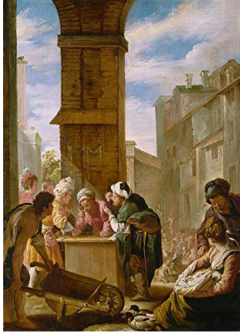
Figure 2. Domenico Feti, The Parable of the Precious Pearl , 1621, oil on poplar wood, Kunsthistorisches Museum, Vienna.