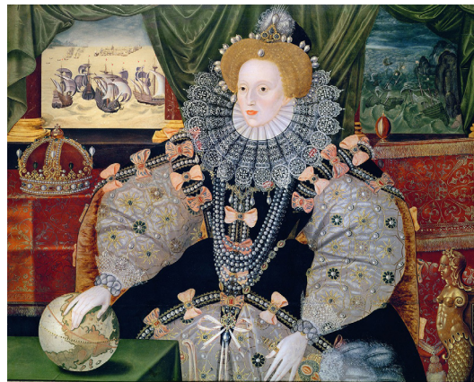
Figure 6. George Gower, Portrait of Elizabeth I of England, The Armada Portrait , c. 1588, oil on panel, 105 x 133 cm, Woburn Abbey, Bedfordshire.

The Armada Portrait (c.1588) attributed to George Gower (c.1546-1596) (Figure 6) is an impressive picture of Queen Elizabeth I (1533-1603). It is a statement of power and authority with Queen Elizabeth I as Empress of the world and commander of the seas. It is known as The Armada Portrait because it commemorates the great sea battle of 1588 when the English fleet defeated the invading Spanish Armada sent to overthrow Elizabeth. The view of the battle in the two windows, recalls Elizabeth's victory. Her hand is firmly on the globe and the mermaid hints at her dominance on the seas. Her dress, in her preferred colours of black and white, also proclaims her rank and is covered with precious pearls (www.woburnabbey.co.uk).