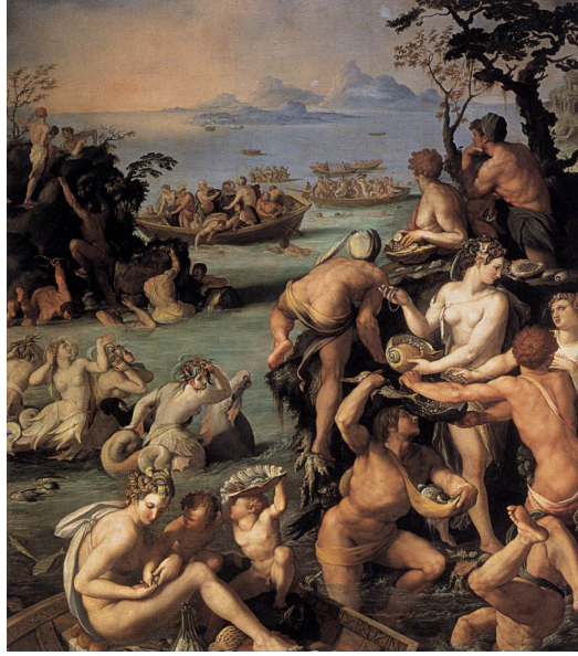
Figure 4. Alessandro Allori, Pearl Fishers , 1570-72, oil on slate, 86 x 116 cm, Palazzo Vecchio, Florence.

Flemish Baroque artist Jacop Jordaens (1593-1678) depicted a significant and exciting moment in the banquet of Kleopatra (Figure 5). Pliny's Natural History is the source for the subject of this painting. Cleopatra, Queen of Egypt, was famed not only for her intelligence and her beauty, but also for her extreme manners. Once, seeking to amaze her darling Roman commander Mark Antony with her wealth, she dissolved a large pearl in a glass of vinegar, and then drank it down to the very last drop. Jordaens pictured the moment when Cleopatra drops the pearl earring into the vessel, while Mark Antony, his companion and a servant freeze in bewilderment. The allegorical composition was seen as a judgment on pride or vanity, and this type of didactic messages were typical of the Flemish school of painting ( www.arthermitage.org ).