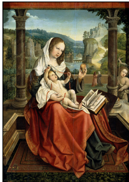
Figure 10. Bernard van Orley, The Virgin and Child with the Infant Saint John the Baptist , 1515-1520, oil on panel, 71 x 98 cm, Museo del Prado, Madrid.

Northern Renaissance artist Bernard van Orley (1487-1541) delineated a religious scene with corals. Mary is holding a pear in her hand, one of the fruits of paradise, which presents her as the new Eve. The Christ Child sits on her knees and plays with a coral rosary. Saint John, as a boy, stands behind a column, pointing to the Sacred Scriptures that announce Christ's mission as savior. The scene takes place under a Renaissance architecture in the form of a gallery or observatory open to a garden ( www.museodelprado.es ).