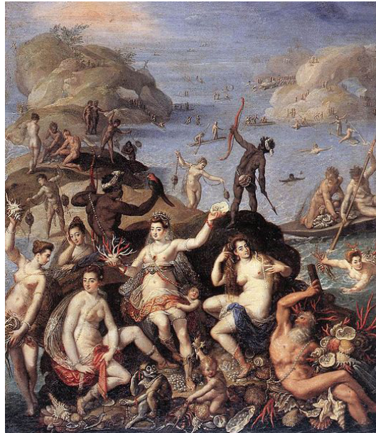
Figure 13. Jacopo Zucchi, The Coral Fishers , c. 1585, oil on copper, 45 x 55 cm, Galleria Borghese, Rome.

The elegant Coral Fishers (Figure 13), also referred to as Allegory of the Discovery of the New World , by the Italian Mannerist painter Jacopo Zucchi (1541-1590) formerly decorated Cardinal Ferdinando's studiolo in the Villa Medici in Rome. Zucchi enriched mythological stories and allegorical pictures with an attention to naturalistic details ( www.wga.hu ).