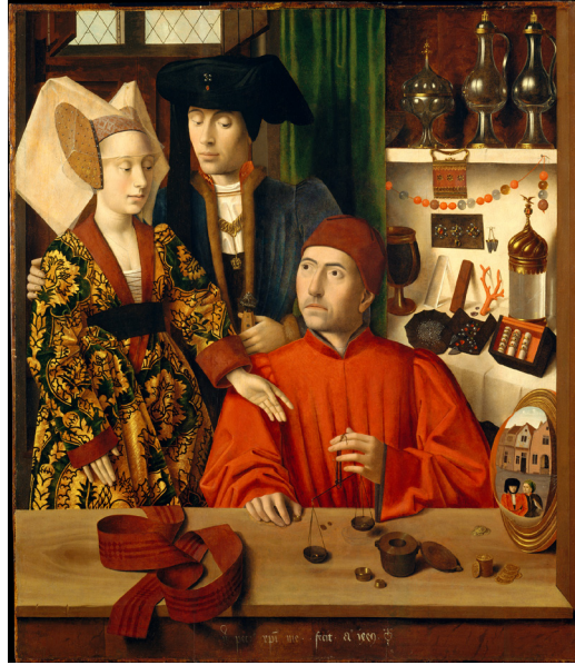
Figure 9. Petrus Christus, A Goldsmith in his Shop , 1449, oil on oak panel, 85.8 x 100 cm, Metropolitan Museum of Art, New York.

Northern Renaissance artist Bernard van Orley (1487-1541) delineated a religious scene with corals. Mary is holding a pear in her hand, one of the fruits of paradise, which presents her as the new Eve. The Christ Child sits on her knees and plays with a coral rosary. Saint John, as a boy, stands behind a column, pointing to the Sacred Scriptures that announce Christ's mission as savior. The scene takes place under a Renaissance architecture in the form of a gallery or observatory open to a garden ( www.museodelprado.es ).