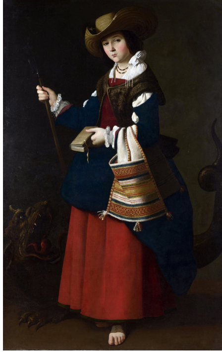
Figure 3. Francisco de Zurbarán, Saint Margaret of Antioch , 1630-34, oil on canvas, 105 x 163 cm, National Gallery, London.

Italian Mannerist painter Alessandro Allori (1535-1607) depicted pearl fishers (Figure 4) for Palazzo Vecchio in Florence. The studiolo of Duke Francesco I de Medici is located on the second story of the Palazzo Vecchio and was used for two of the duke's main interests: geology and alchemy. The program was devised by the learned Vincenzo Borghibi, a Benedictine abbot, who had close ties to the Medici family. Thirty four paintings were commissioned in all (Zirpolo, 2016, p. 418).