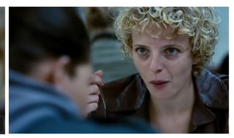
Figure 9: The mysterious Oriental as the object of knowledge and desire for the Western

Hints of Orientalism are also given with scenes of May Day demonstrations from Germany and Turkey. In Germany, it is pictured as just another day, people and bands march with banners and slogans; no police force is ready, passers-by watch the demonstrators, and there is no chaotic atmosphere. Germany is the signifier of the Western common sense. On the other hand, May Day demonstrations in Istanbul are characterized by a dominance of political extremism and conflict signifying the chaotic Orient (Figure 10).