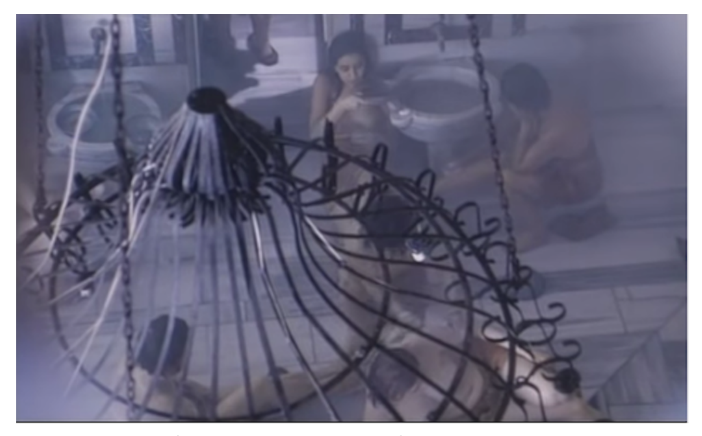
Figure 2: The partly nude female body as the passive object of the male voyeuristic gaze

Girelli (2007, p. 23-24) reads hamam as a symbol of Turkey, "a country which throughout the film remains profoundly exotic and archaic ... resting on Western notions of Oriental difference, antiquity, seduction, and alternative lifestyle", and she asserts that this Orientalist representation "depends on an original distance between the Self and the Oriental Other." In line with that, in the film, the beholders of the voyeuristic gaze, regardless of their designated gender roles as female or male, correspond to the phallocentric Western eye, and the Orient signified with a hamam is the object of it. The position of the camera or the choice of voice-over facilitate the spectator's identification with the gaze of the camera; in this case, the male-oriented Western eye.