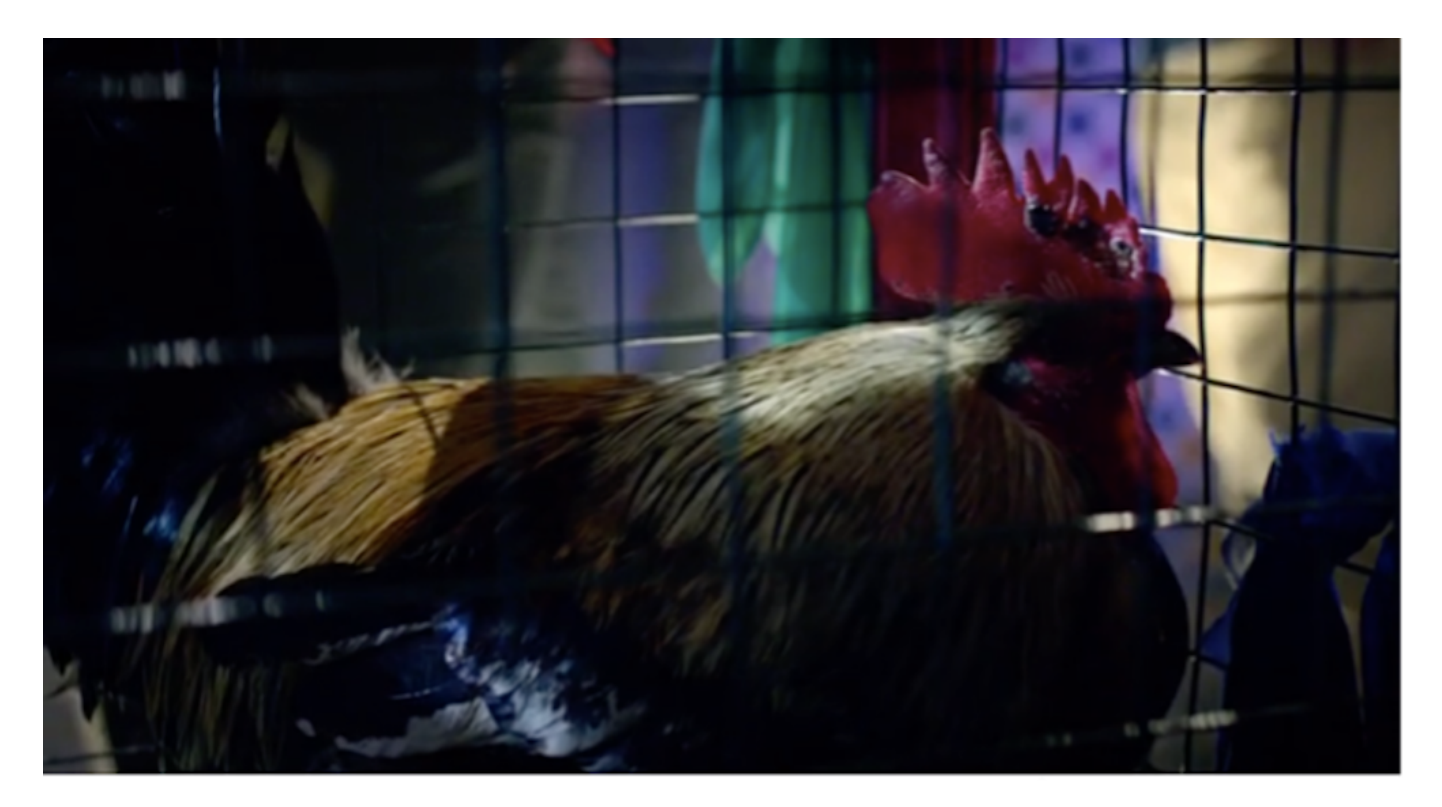
Figure 7: Can's rooster in a cage

The representation of the Oriental male characters, namely of Can, Ahmet, Ahmet's father Yılmaz (Ünal Silver), and the men Ahmet meets on the streets defies normative masculinity. On the other hand, Daniel, as the only Western male character, is portrayed going through a transformation in the Orient. And the evidence of his transformation is given with his growing a moustache on Ahmet's demand, indulging in delicious food and the beauties of Istanbul signifying the Oriental self-indulgence and jouissance, trying to speak Turkish, and the telephone conversations with Germany getting shorter. Gradually he is blended in the culture, and he starts to feel content with the person he has turned into.