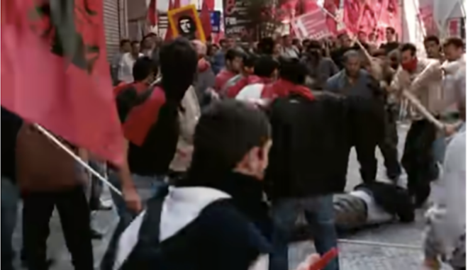
Figure 10: May Day demonstrations from Germany and Turkey

Overall, the socio-political imagery in Auf Der Anderen Seite is drawn upon straight, mighty, all-correct, lawful, and savior West against chaotic, unlawful, and despotic Orient. The political structure pertaining to the Orient is characterized by obscurity on the part of the treatment of political extremists, slipperiness, indifference or lack of true mercy and intimacy while the political structure of the West is ornate with respect towards people's dignity and human rights, and lawfulness.